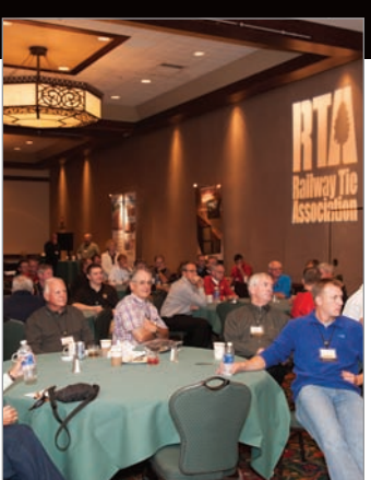
Casino Tournament Group