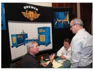
Brewer Machine & Parts